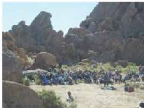
demonstrating in Lone Pine