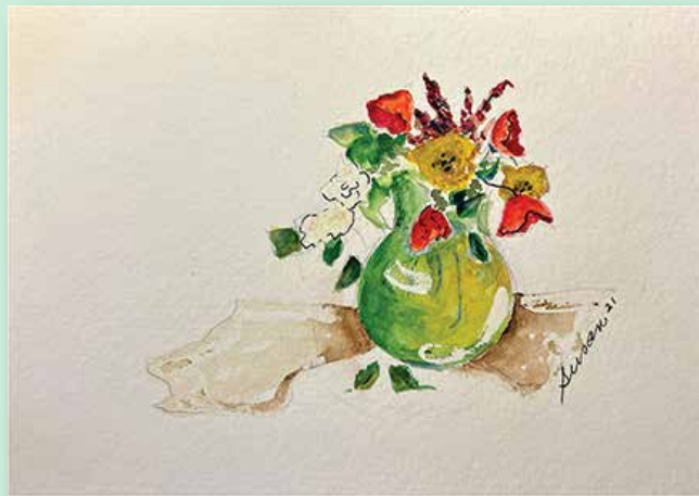
Susan Bernet Mixed Bouquet Watercolor, 5" x 7"