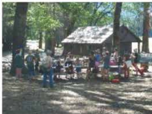
teaching in Yosemite