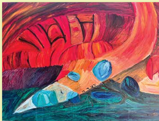
Stuart Berlin Light and Shadow Ocean Cave