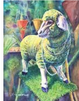
• "EwePhoria" 2nd place in watercolor at the Ventura County Fair

We take pride in our members and want to congratulate and acknowledge you and your achievements, by including you in our newsletter.