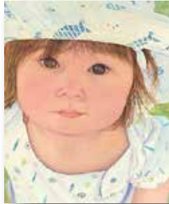
• "Sweet Ziggy" 3rd place in watercolor at the ACCV Show