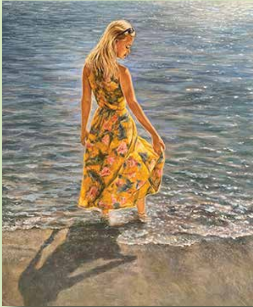
Helle Urban Sun-kissed Glow