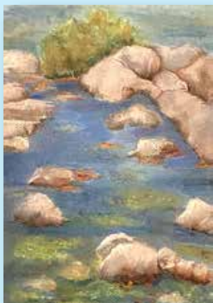
Susan Bernet Culver City, pastel 7" x 10"