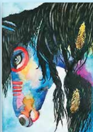
Susan Contreras Untitled