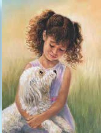
Helle Urban Tender Moment oil 18" x 24"