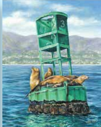
Helle Urban Sunbathers oil 11" x 14"