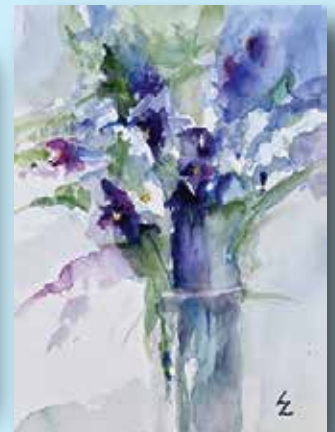
Lee Zimmerman Fresh Flowers watercolor, 9" x 12"