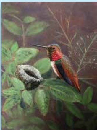
Terry Walson untitled, pastel