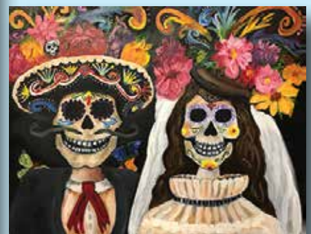
Susan Contreras Untitled