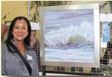
1st Place _The Light Within_- Carmen Lamp