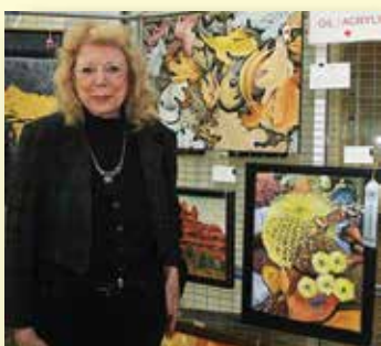
HM _Barrel Cactus and Snake_Pat Duggan