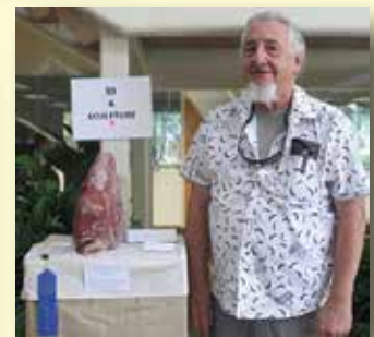
Sculpture _1st Place_ White Buffalo Calf Woman_Walter Morosco