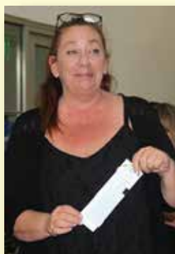
HM _Energy_Dawn Marple