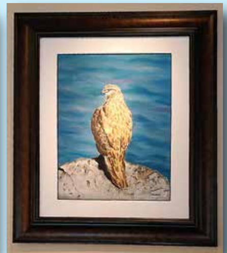
Persy Evans Tawodi Pastel, 20" x 16"