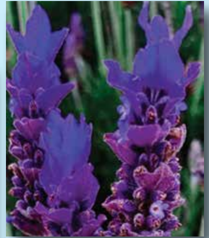
Jessica Brock Purple Flames Photograph