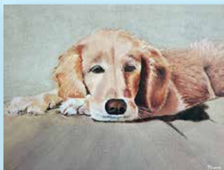
Persy Evans Lazy Daze Acrylic, 16" x 20"