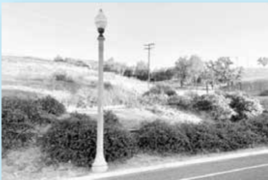
Jessica Brock Peaceful Road Photograph