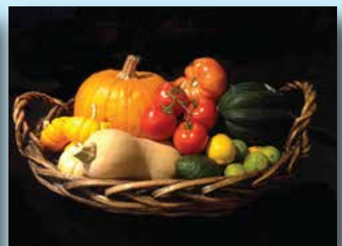
Terry Walson Fall Harvest, Photograph