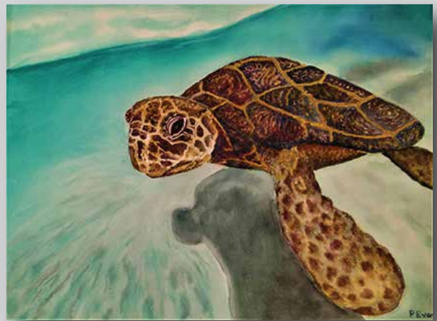
Priscilla Evans Kai Honu Watercolor, 12' x 16"