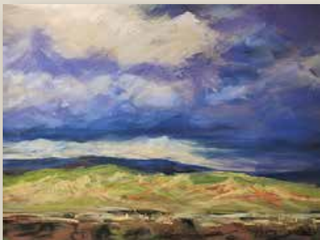
Tom Evans Simi Hills, pastel, 16" x 20"