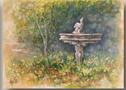
Helle Urban Old Wooden Birdbath, Oil, 12" x 9"