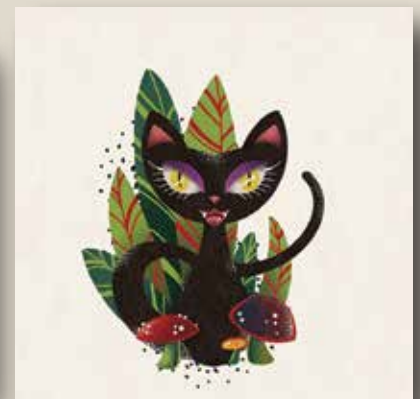
Victoria Marble Bad Luck, Digital Illustration, 7" x 7"