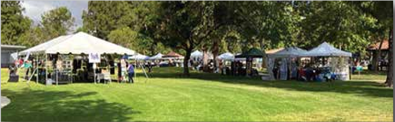
SVAA members setting up their artwork