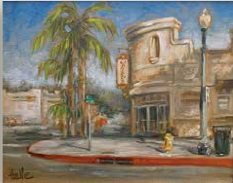
Helle Urban Mayfair Market, Oil, 10" x 8"