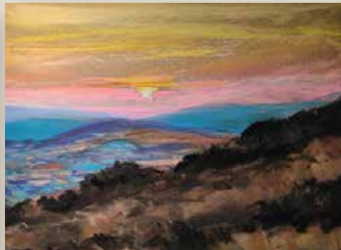
Tom Evans Sunset over Simi, pastel, 16" x 20"