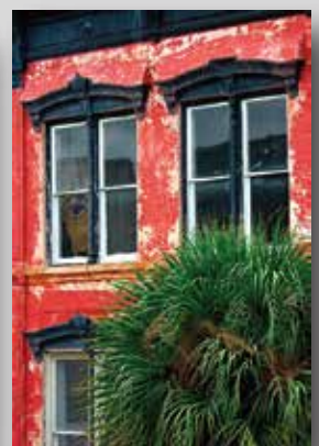
red building savannah