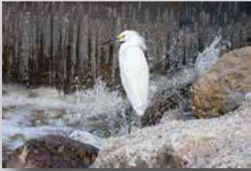
Splash_1st Place_SVAA 2023 Fall Art Show

With the move from South Carolina and the COVID restrictions I had not been able to find a photo club that met my needs creatively and that is how I recently happened upon SVAA. Being honored with a first place ribbon in the digital photography category was both a welcomed surprise and an acknowledgment that I have found a home for my art.