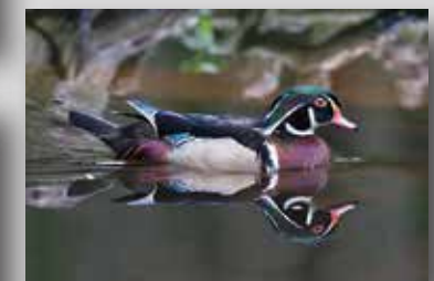
Shot 6_Wood Duck.