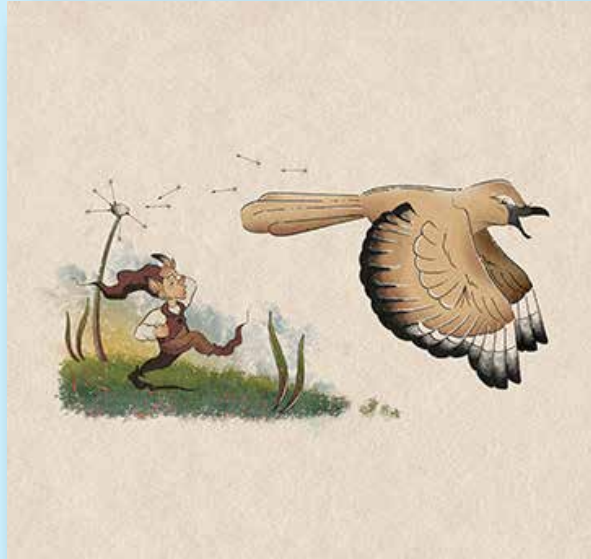
Victoria Marble Mockingbird in Flight Digital Illustration