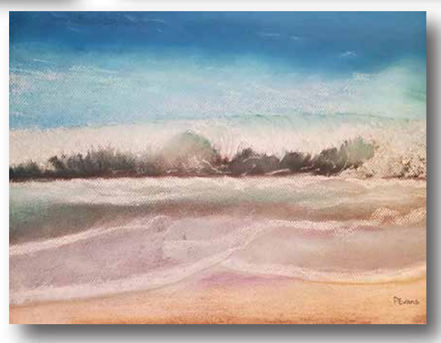
Persy First Wave, Pastel 12x16