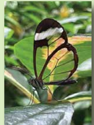
Sandra Keppler Transparent Beauty.