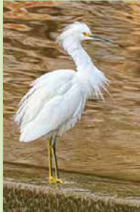
Snowy Egret on the Arroyo