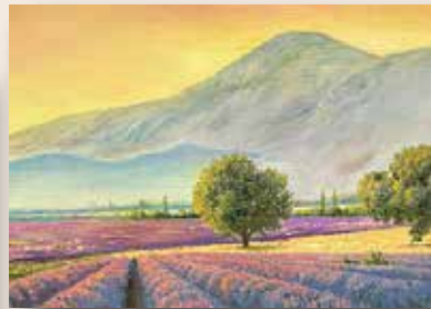
Tranquility_Oll on canvas