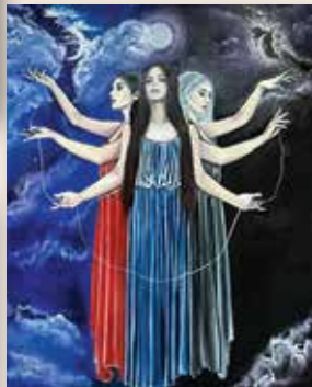
The Trio_Oll on canvas