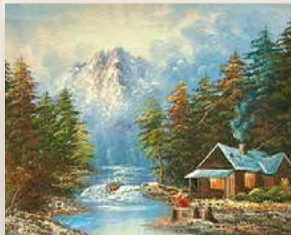
Mountain Cabin_Oll on canvas