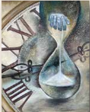
Time_Oll on canvas