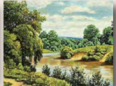
My Childhood Memory _Oil on paper