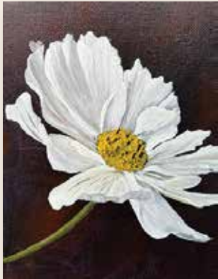
Purity_Oll on canvas