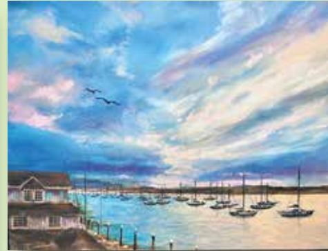
Tom Evans Unsettling Sky_Pastel