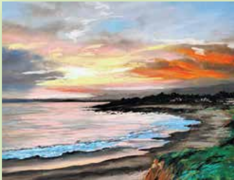
Tom Evans Twilight at MoonStone Beach_Pastel