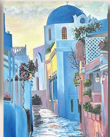
After the rain in Greece_Oil on paper