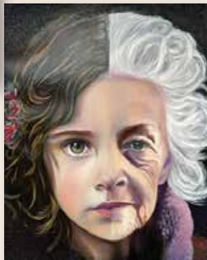
Life_Oll on canvas