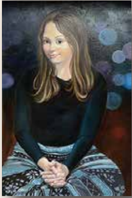
Leah_Oll on canvas