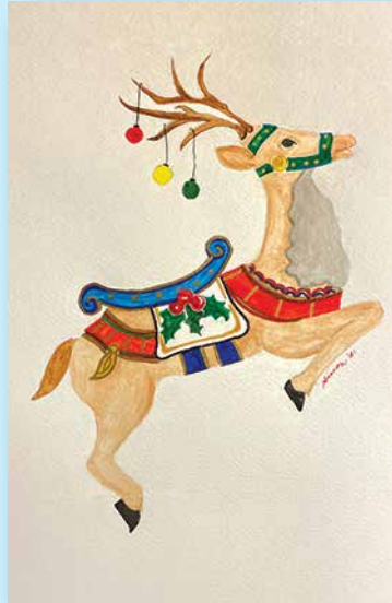
Susan Bernet Xmas 2021 Watercolor and Pen, 6.5" x 10"