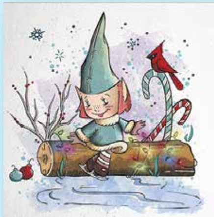
Victoria Marble Christmas Elf Mixed Media, 11" x 14"