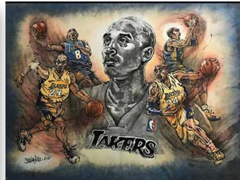
Stella Kwan Untitled 38"x27" Chinese Ink on Rice Paper