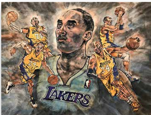
Stella Kwan Untitled 38"x27" Chinese Ink on Rice Paper