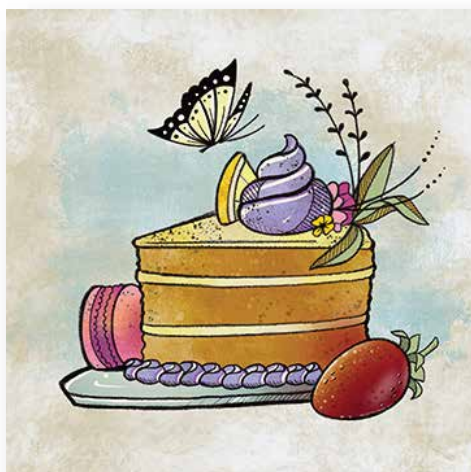
Victoria Marble Lemon Poppyseed 2048 x 2048px digital