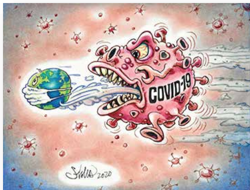
Stella Kwan Untitled 8"x10" mixed media