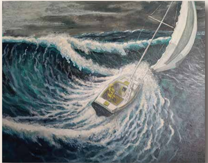
Lyman Young Storm Sail 16" x 20", Acrylic