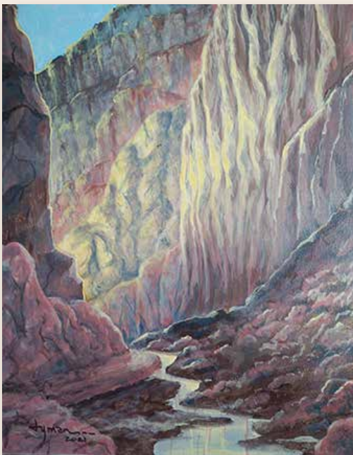
Lyman Young Cathedral Canyon 16" x 20", Acrylic