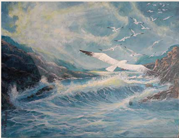
Lyman Young Away, 16" x 20", Acrylic